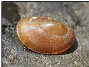
BLUE RAYED LIMPET