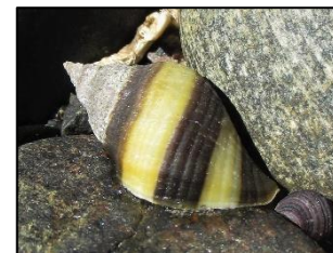
COMMON DOG WHELK