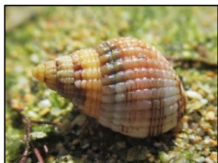
NETTED DOG WHELK