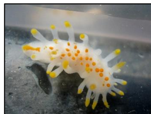
ORANGE CLUBBED SEA SLUG