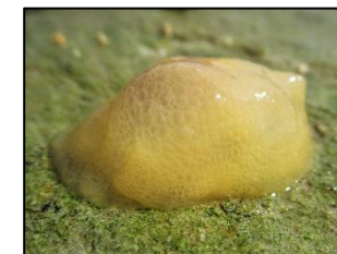
YELLOW PLUMED SEA SLUG