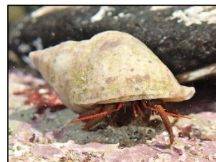
ST PIRAN'S CRAB