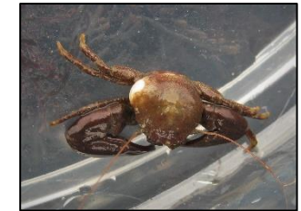
LONG CLAWED PORCELAIN CRAB