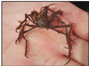
LONG LEGGED SPIDER CRAB