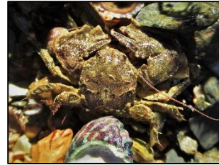
BROAD CLAWED PORCELAIN CRAB