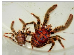
SPINY SQUAT LOBSTER