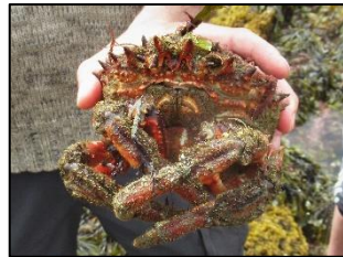
COMMON SPIDER CRAB