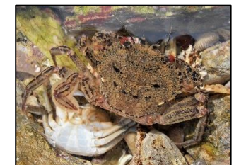
VELVET SWIMMING CRAB