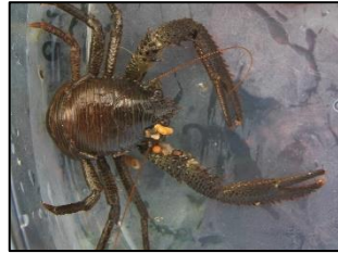
BLACK SQUAT LOBSTER