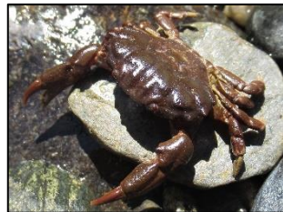
MONTAGU'S FURROWED CRAB