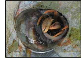
COMMON HERMIT CRAB